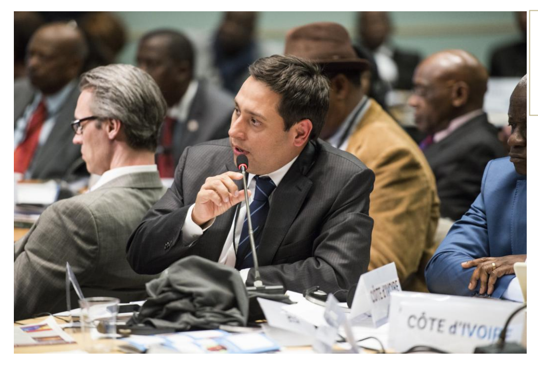
Hon. Oscar Mauricio Lizcano Arango (Senator, Colombia inquiring to the panel about best practices in establishing health systems.

Hon. Oscar Mauricio Lizcano Arango, Senator from Colombia, wished to explore best practices, asking in which ways a health system should be functioning most properly. Mr. Evans cited that universal health coverage is the identified goal to create a properly-functioning health system in the SDGs; thus to his mind, universal health coverage is the best practice.