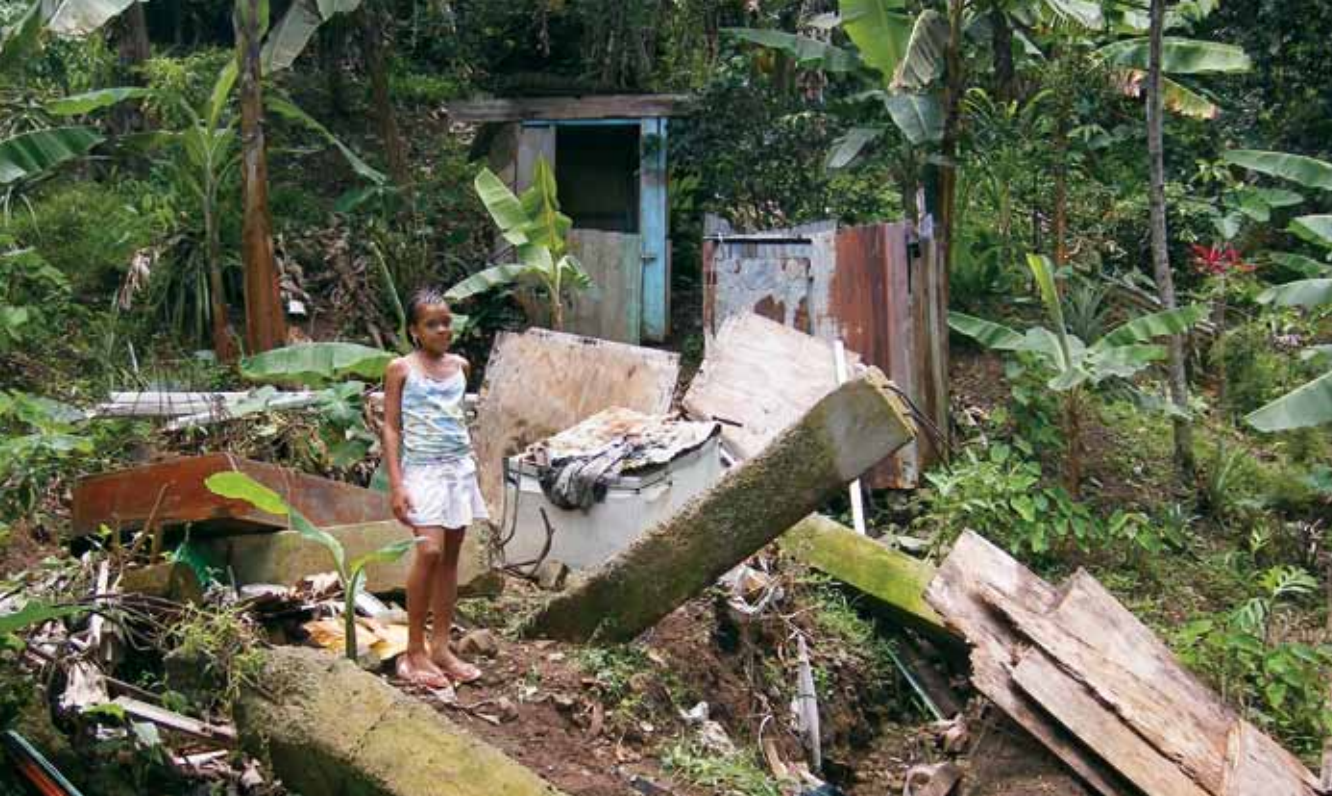
Destruction of a house caused by a rainfall-triggered landslide in an urban community - Castries, Saint Lucia.