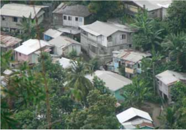
Typical urban hillside community in Saint Lucia.