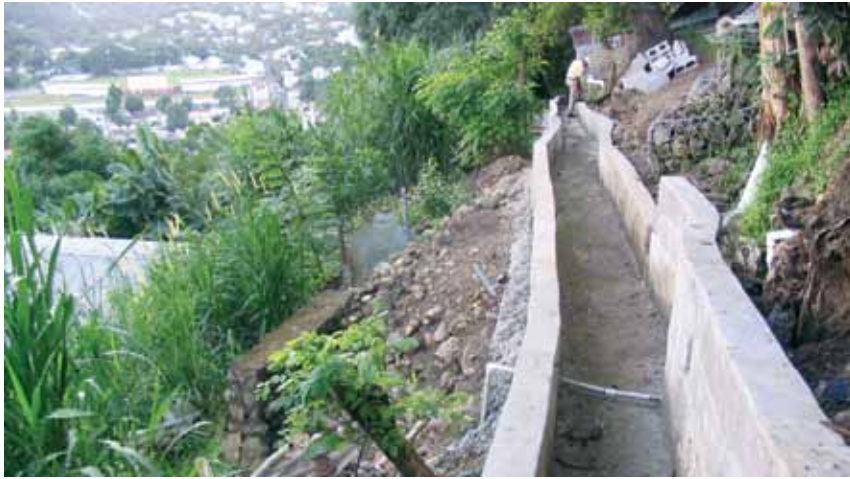
Example of drain to collect and redirect surface water runoff to prevent soil saturation and landslides.

“ [During Hurricane Tomas] the water was as high and gushing as I never seen before. The timing of the drains being installed was so right, just before the storm, as no landslides occurred as they did before.”