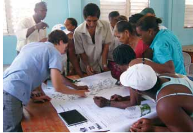
Discussing the surface water and slope stability issues and potential drainage solutions at a community meeting.

sometimes increasing the hazard itself. MoSSaiC focuses on the most economically, socially, and physically vulnerable of these urban hillside communities.