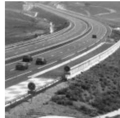
A highway construction project is being arbitrated at ICSID.

Established 1966 ■ 139 Members Total cases registered: 129 Fiscal 2003 cases registered: 26