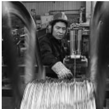
IFC provided financing to Tecnofil in Peru to help the company upgrade its manufacturing processes for copper products.

Established 1956 ■ 175 Members Committed portfolio: $23.4 billion (includes $6.6 billion in syndicated loans) Fiscal 2003 commitments: $3.9 billion in 204 projects in 64 countries