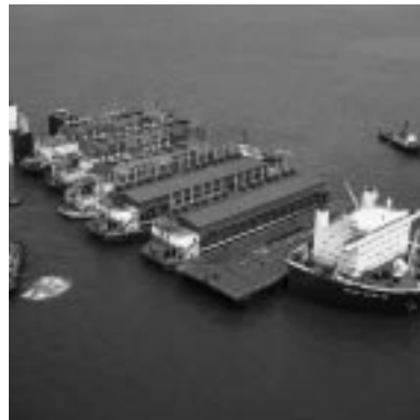
MIGA's guarantee program supported this project, which involved a Singaporean investor transporting barge-mounted emergency power generators to northeastern Brazil, to alleviate severe electricity shortages resulting from drought.

Established 1988 ■ 162 Members Cumulative Guarantees 1 Issued: $12.4 billion Fiscal 2003 guarantees issued: $1.4 billion