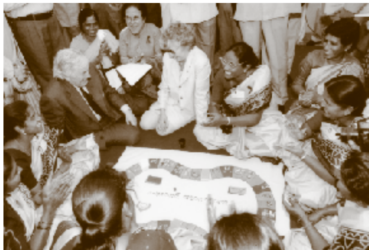
In Hyderabad, India, a group of women peer educators animatedly explain to James D. Wolfensohn their work on HIV/AIDS awareness programs under the Bank-supported National AIDS Control Project.

Middle-income countries, too, are addressing poverty-related concerns ranging from inequality and governance to urban pollution and rural infrastructure, and are increasingly adopting sound macroeco-