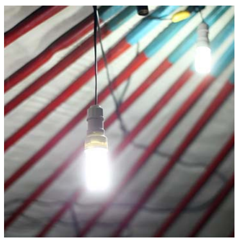
Lights powered by solar electricity

much work to be done. The hope, however, is that the systems and institutions developed under REAP will continue this effort of bringing electricity to nomadic herders throughout the country. The GoM's National Renewable Energy Plan (2005-20) is aiming for universal connectivity by 2020. As Mongolia currently experiences an economic boom from the exploitation of its mineral wealth, efforts such as herder electrification can help ensure that this important community, which connects the country to its rich history, can maintain their way of life without being left behind.