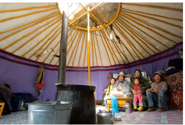
A herder family gathering under the lights in their ger

designed to improve rural livelihoods are relying on televisions, for example, to communicate to herders about opportunities for insuring against livestock losses due to inclement weather. There are increasing instances of cellular telephones being used to arrange business transactions, for example, for the sale of cashmere during the season – an important source of income Although a primary for many herders. objective of the electrification effort was to directly improve the quality of life for herders, the SHSs are also contributing