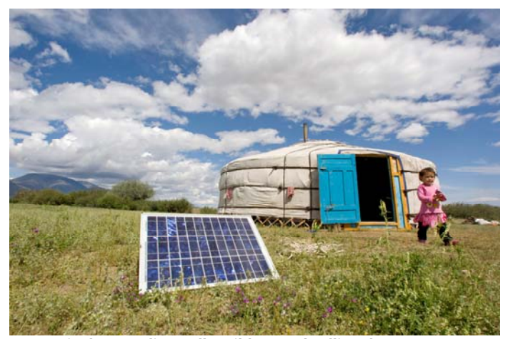
A typical Mongolian collapsible tent dwelling, know as a ger, with a Solar Home System panel

The SSCs also played a crucial role that helped address a key challenge to providing rural electricity access in Mongolia. Successful herder electrification was predicated on the development of the widest possible sales distribution network that could reach the widely dispersed population in Mongolia's vast landscape. The 50 SSCs, with at least one in each of Mongolia's 21 provinces/aimags, served as an important conduit for promoting and selling SHSs throughout the country. The