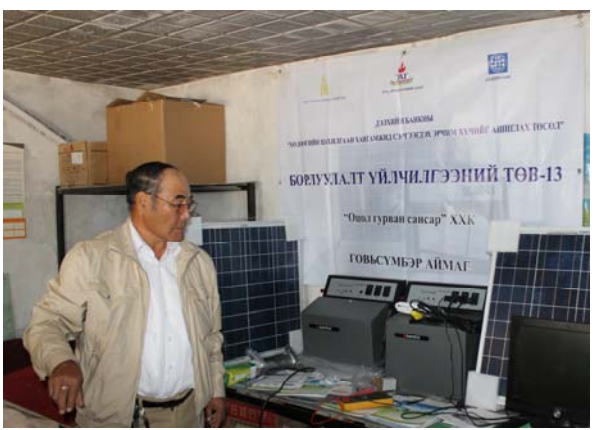
Owner of a private Sales and Service Centers established under REAP showing his equipment

rural areas in which they operated. Many SSCs found it enterprising to sell SHS and provide electricity to herders as it created a substantial market for associated consumer electronics and appliances. As a part of the REAP, 50 SSCs were established throughout Mongolia with at least one in each of the twenty one provinces/aimags in the country, as illustrated in Figure 3. The number of SSCs in a given province reflected its market size for SHSs. For example, due to the relatively small herder population in Orkhon province/aimag, it has one SSC