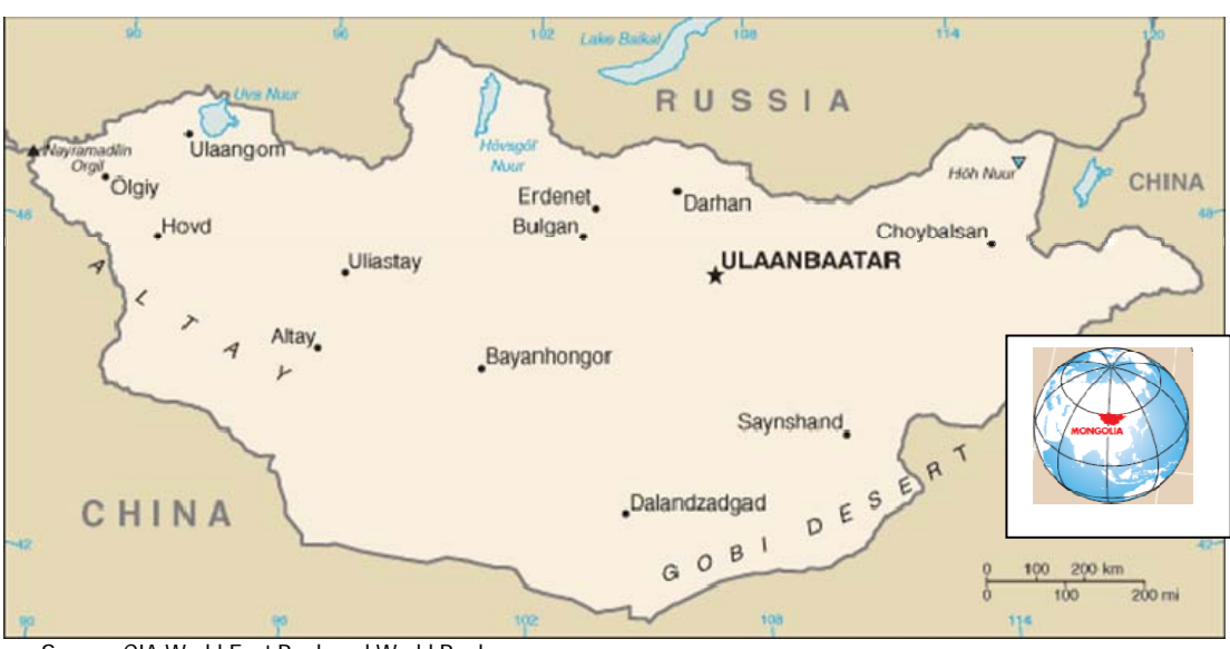
FIGURE 1: Map of Mongolia

degrees Celsius, and the cold weather lasts for most of the year. As a result, the land is barren most of the time with scarce vegetation. Therefore, herders have little choice but to roam the vast rural country side in search of pastures where livestock can graze. Herders frequently relocate with all of their belongings including the portable tents they use for housing, commonly referred to as Gers, as they go in search of pastureland. However, they are in regular contact with the local villages or soums to which they are registered for conveniences including restocking supplies, community activities, administrative matters etc. Given their nomadic lifestyles, herders do not have access to basic infrastructure and other services, including electricity; the herders largely live a life of self sufficiency. Most of their energy needs are met through the