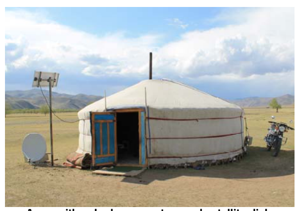
A ger with solar home system and satellite dish