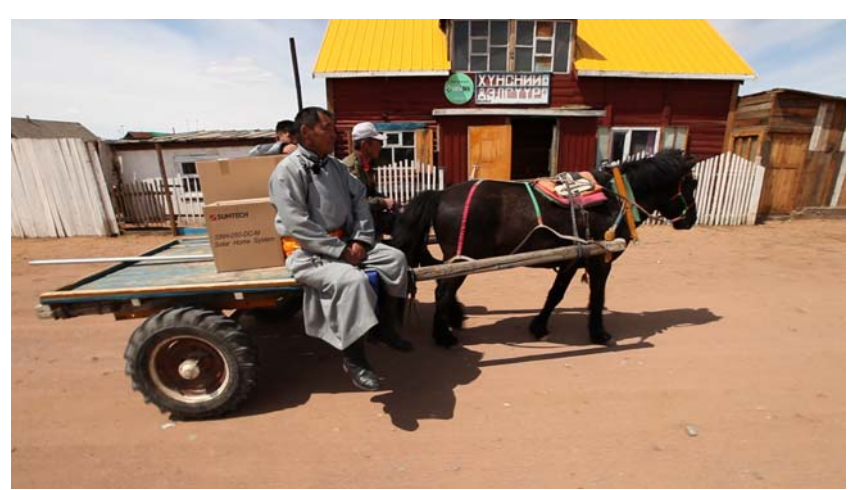
Herder transporting a newly purchased solar home system to his ger

electrification programs, to incorporate some mechanism to ensure the quality of the products being distributed. In many remote and rural areas in Mongolia, herders have little access to information that would enable them to differentiate the quality reliability of various SHSs that may be sold in the market. The nascent state of the market for SHSs means that there is little historical information related to the past performance of different products that consumers can rely on to make informed purchases. The information that is easily available to herders asymmetric. is Therefore, the SHS equipment sold through REAP were required to meet internationally recognized technical standards and were rigorously tested for performance. Bulk purchases were tested at the manufacturer as well as upon receipt. Certified private dealers were also required to maintain high quality standards and confirm compliance