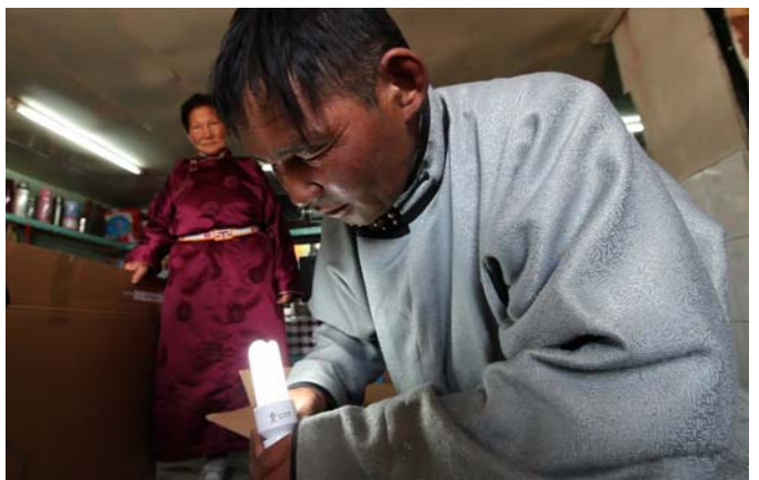
A herder inspecting a solar home system before purchasing at a Sales and Service Center

Soum Administrator Network: The GoM already had a network of administrators that were based in each of the 342 soums scattered throughout the country. This Soum Administration Network proved to be instrumental in kick-starting the National