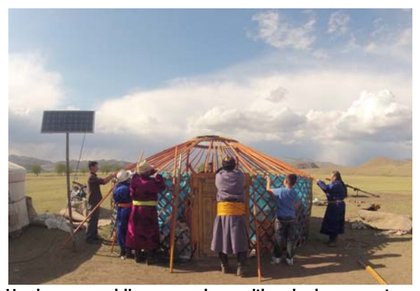
Herders assembling a ger along with solar home system

The changes introduced by REAP to the design of the National 100,000 Solar Ger Electrification Program contributed to scaling-up its implementation and meeting its targets. Commencing at the end of 2006, REAP was originally designed to add 50,000 SHSs to the approximately 33,000 systems that were already distributed by the The remaining 17,000 GoM's program. SHSs to achieve the national target of 100,000 SHSs were expected to be implemented by the private dealers and SSCs on an ongoing basis following the completion of REAP. Instead, due to an aggressive effort by the GoM to scale-up, REAP exceeded the project target by almost thirty five percent by selling over 67,000 systems; and helped achieve the target established in the National 100,000 Solar Ger Electrification Program.