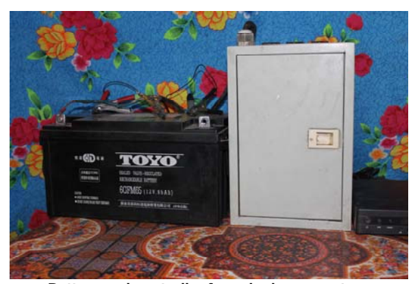
Battery and controller for solar home system