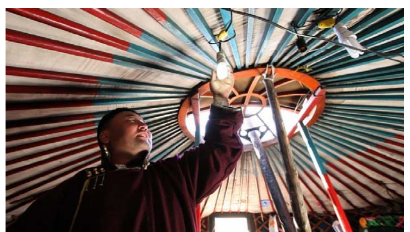
Solar power providing lighting inside a Mongolian ger

In 2000, the Government of Mongolia (GoM) embarked on an ambitious program to provide modern electricity to its large herder population which could be adapted to their nomadic way of life. The goal of the National 100,000 Solar Ger Electrification Program (The Program) was to electrify over 500,000 herders and their families. Mongolia is often referred to as the "Land of the Blue Sky" due to its clear skies that provide an unusually high number of brightly sunlit days in a year, even during