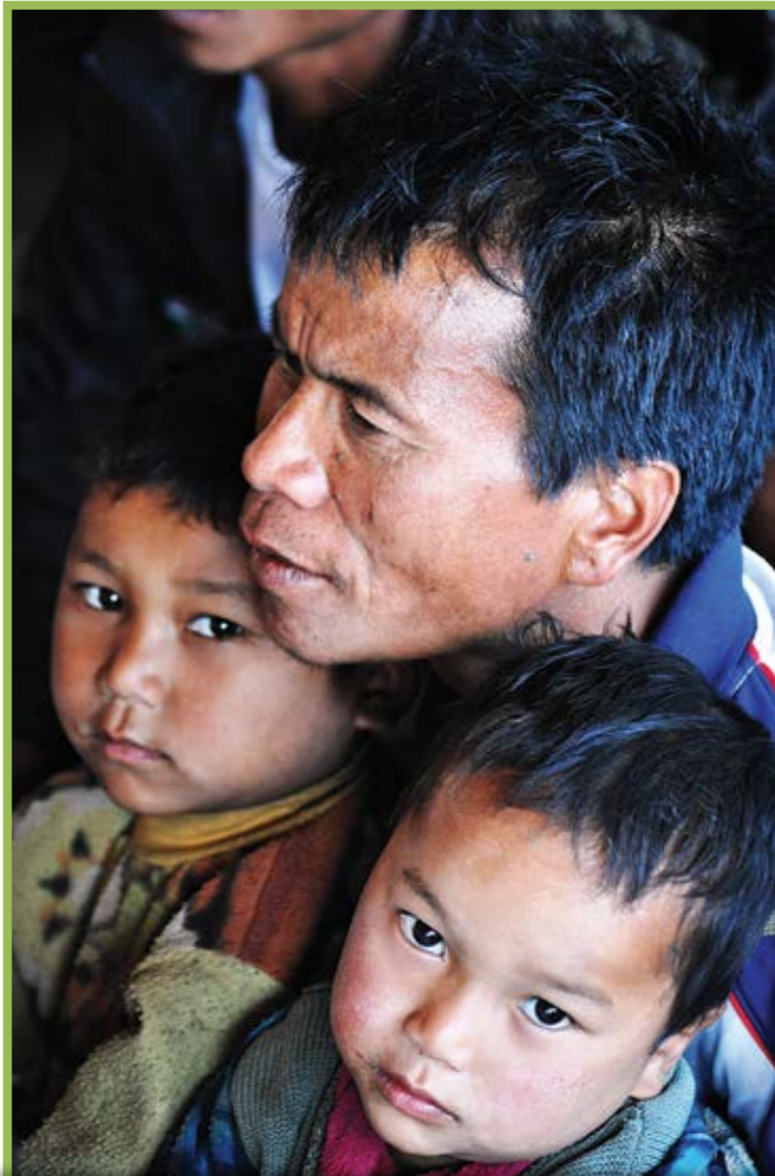
Villagers in Kanpetlet Township, Chin State